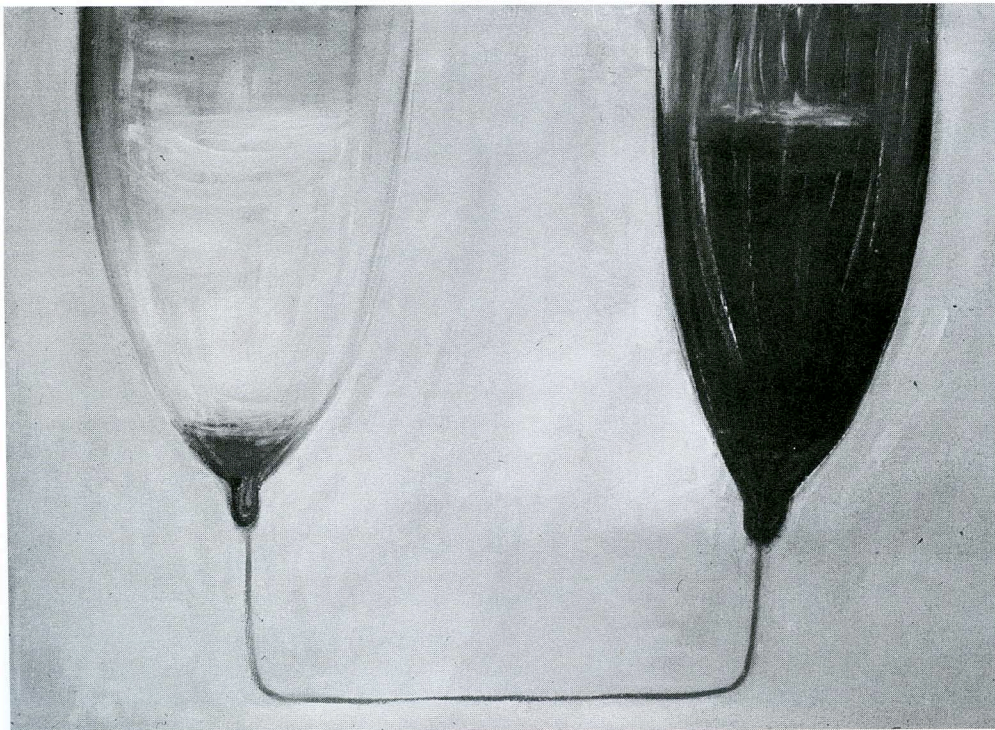
MIRA SCHOR Liquidity , 1989. Oil on canvas, 12 x 16 inches