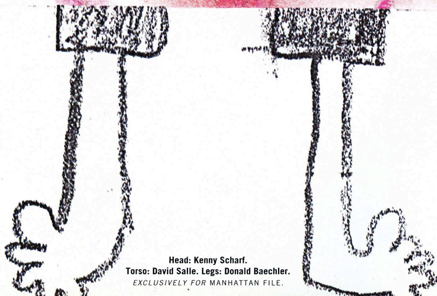
Head: Kenny Scharf. Torso: David Salle. Legs: Donald Baechler. EXCLUSIVELY FOR MANHATTAN FILE.